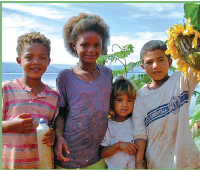
Children at an MST camp, in the state of Minas Gerais .

other country where people are eating lizards to survive.”