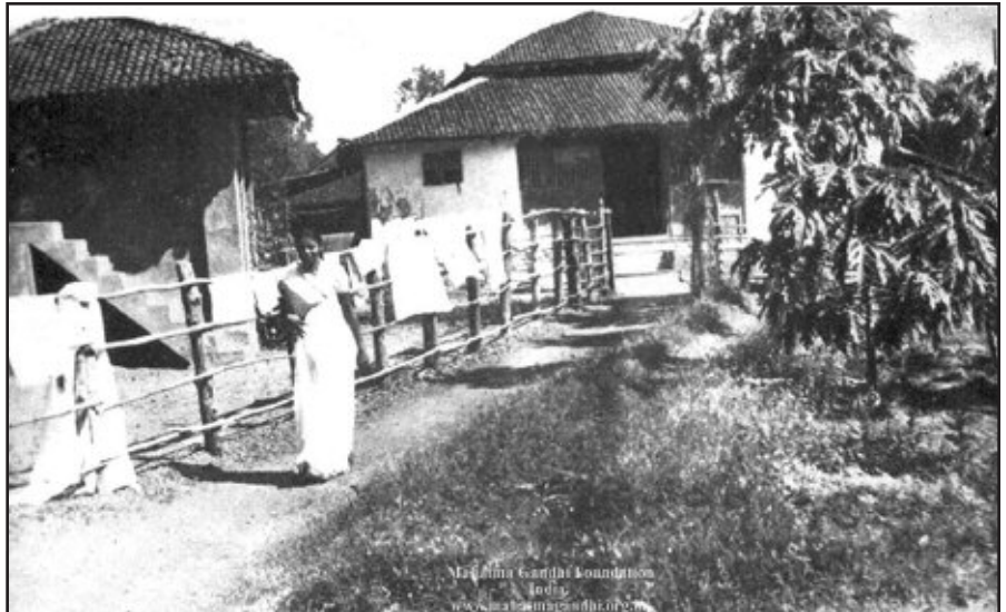
A picture of Sevagram Ashram in Wardha, central India. Gandhi's ashrams were experiments in self-rule and small-scale community. ( http://www.mahatma.org.in )

Gandhi's nationalism stood to disband the Congress Party upon independence, "Its task is done. The next task is to move into villages and revitalize life there to build a new socio-economic structure from the bottom upwards." 13 He also understood patriotism differently